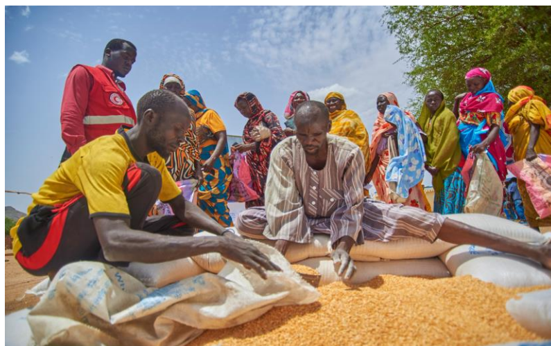
Lowcock attended a WFP food distribution while in South Kordofan (May 2018)