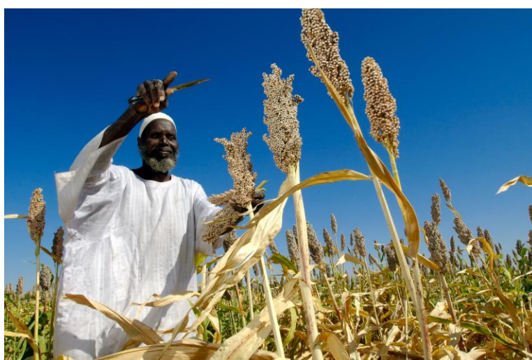
A farmer harvesting sorghum in Sudan

According to the latest Global Information and Early Warning System (GIEWS) Food Price Monitoring and Analysis (FPMA) Bulletin , in the capital, Khartoum, prices of wheat increased in April by more than 10 per cent after a 20 per cent decline in March. Overall, cereal prices in April were more than twice year-on levels and at record or near-record highs after sharp increases in late 2017 and early 2018, following the removal of wheat subsidies in the 2018 budget (FPMA Food Policies) and the strong depreciation of the local currency. The removal of subsidies of electricity, coupled with limited availability of fuel across the country, and resulting higher prices of transport contributed to the increase in food prices. Localized production shortfalls affecting the 2017 harvest provided