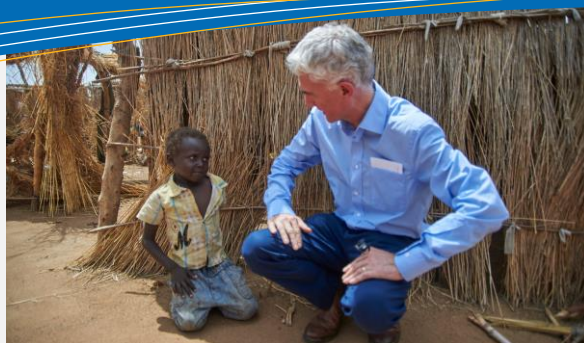
Mark Lowcock talking to an IDP child in Kadugli, South Kordofan (UN, 2018)